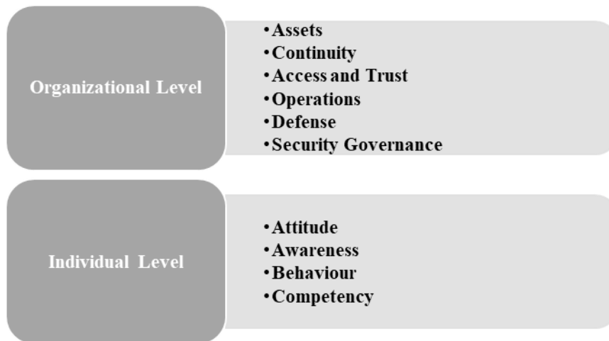
Figure 2. Cyber-Security Culture Model: Levels & Dimensions

An assessment methodology along with a weighting algorithm have been developed based on the previously mentioned model in order to offer a clockful cyber-security culture evaluation framework which shall be used as the basis of survey under design.