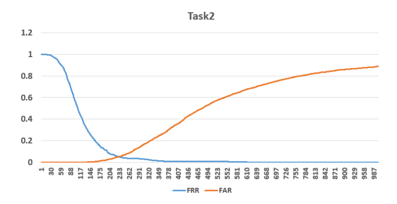
Figure 3. Task2 results.