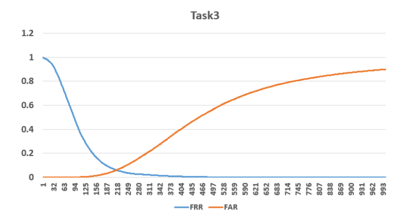
Figure 4. Task3 results.