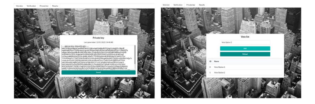
Figure 2. GUI of implemented solution. Page to set RSA key and Voting list

the key entered. The two components of the RSA key (e and n) will be used to encrypt the ballots. Therefore, they are included in the Organization contract.