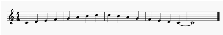
Figure 7. Original Version (Figure 1a)

After creating the sample data and running them through the algorithm, it appears that the general shape and notes of the audio file are preserved. However, there are cases where the converter showed inaccuracies. For example, in the test case where chords are uploaded to the website (Figure 2), the only inaccuracy shown is in the first chord, where the algorithm missed concert C4 (Figure 2b). Another example is Figure 1b, where the C Major ascending & descending scales showed that some notes are carrying on the next beat. When separated (Figure 3), the algorithm works fine again.