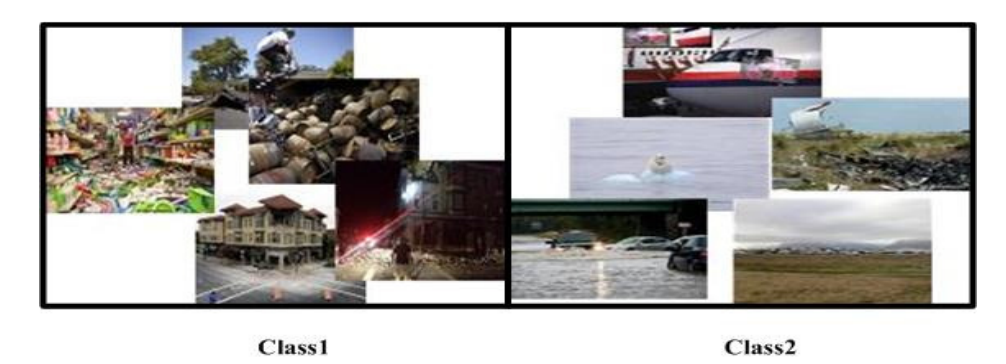
Figure 3. Shows some example images for both classes where class1 meanearthquake is happened, and class 2 means earthquake is not happened

As results of event keyword extraction from our text data, we obtained 100 keywords related to earthquake event such as: earthquake, shock, shake, chill, Napa and others. Then, we produced a composite weight for each term. For image, we classify our data by using K Nearest Neighbours (KNN) classification into two classes depending on the event. Class 1 represents earthquake is happened, and class 2 represents earthquake is not happened. By preparing a training set, we can produce a model to classify tweets automatically into each class. The figure 3 represents the image's sample for the two classes.