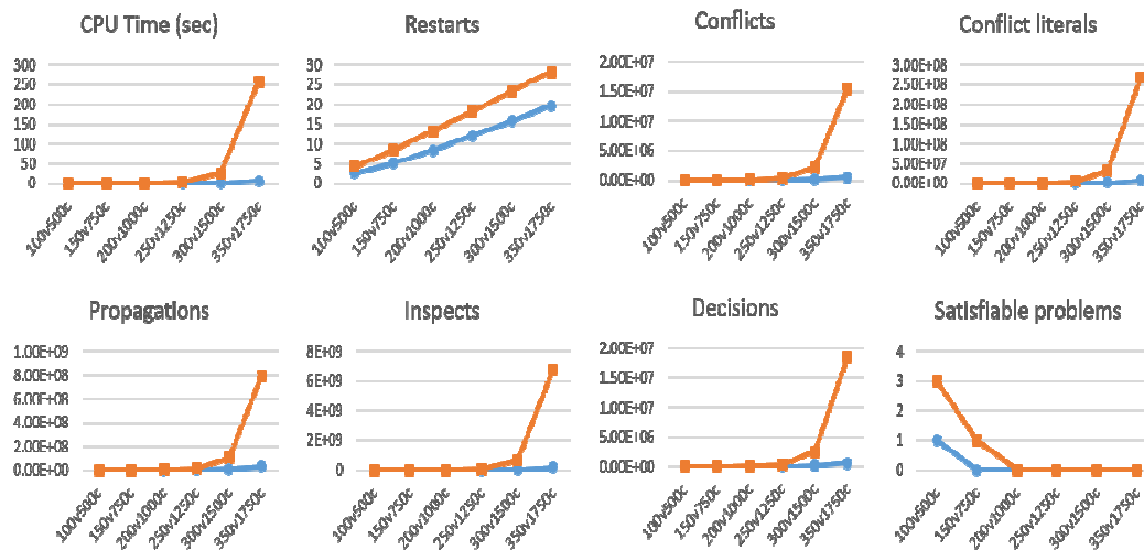
Figure 3: \alpha = 5 , 400 instances, Red: ETRSG, Blue: TSG. Similar to \alpha = 4.24 , but more significant in restart. The probability of generating solvable instances drops quickly to 0 for both since 5 is greater than the critical phase transition number.

R. A. and C. C. gratefully acknowledge the support from the State University of New York Polytechnic Institute.